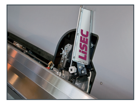
The extended lever supports the frames during the bending process